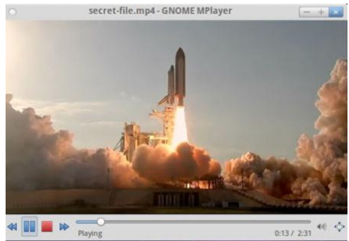
Fig 3. Video Before embedding the data (message)

Again here time complexity also checked. Video with larger size require more time to embed the data (message). And video having less size require less time to embed the data (message) into video. For video testing, run both the video on separate machine simultaneously. And see the difference between two video that is before and after data (message) embedded to video.