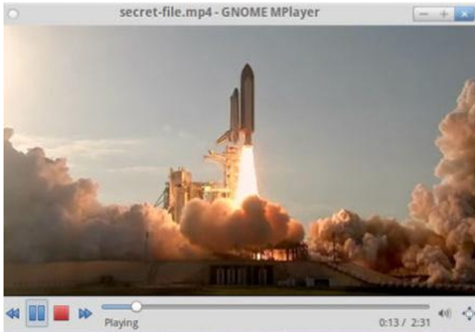
Fig.4 Video After embedding the data (message)

After seeing both Fig 3. and Fig 4., we found that there is no any difference between video before embedding and after embedding the data (message) into video. Because of LSB replacement techniques, Human eye cannot be able to predict this small LSB change in pixels of different frames of a given video. As frames moves very fast and continuously it is unpredictable to find such small change in video.