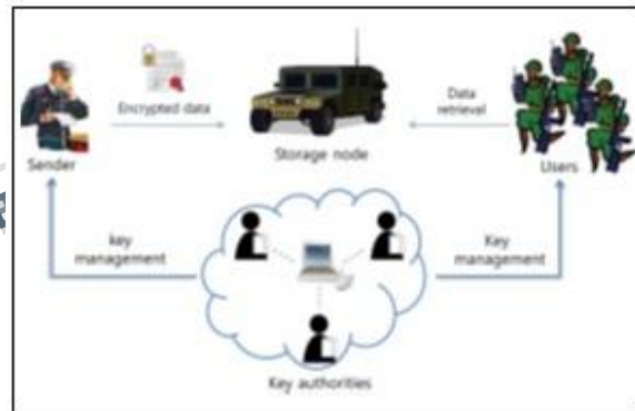
Fig. 1. Architecture of secure data retrieval in a disruption-tolerant military network.

In this section, we describe the DTN architecture and the security model.