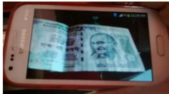
Fig1: images taken for processing