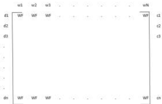
Fig 3: Encrypted Input Matrix (D')

In this protocol the user sends both encrypted file and index to the cloud server. Documents are encrypted using fully homomorphic encryption. User first to extract the N words from the documents based on the word frequency threshold. Here to ignore words less than word frequency threshold. User encrypts each word frequency (Document relevance), file name and index value then send to the cloud in the matrix form as shown in the Fig 3