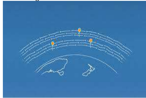
Fig 3 : Navigation With The Wind

Project Loon balloons travel around 20km above the Earth's surface in the stratosphere. Winds in the stratosphere are generally steady and slow-moving at between 5 and 20mph, and each layer of wind varies in direction and magnitude. Project Loon uses software algorithms to determine where its balloons need to go, then moves each one into a layer of wind blowing in the right direction. By moving with the wind, the balloons can be arranged to form one large communication network.