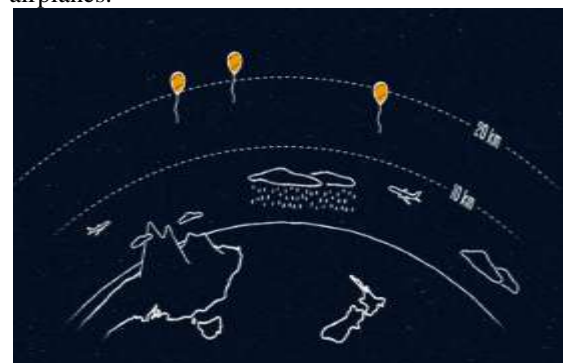
Fig 4 : Stratosphere

Stratosphere Situated between 10 km and 60 km altitude on the edge of space, the stratosphere is named after the different strata, or layers, of wind within it. But the extreme altitude also presents unique engineering challenges: air pressure is 1% of that at sea level, temperatures hover around -50°C, and a thinner atmosphere offers less protection from the UV radiation and temperature swings caused by the sun's rays. By carefully designing the balloon envelope to withstand these conditions, Project Loon is able to take advantage of the steady stratospheric winds, and remain well above weather events, wildlife and airplanes.