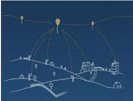
Fig 8 : How Loon Connects