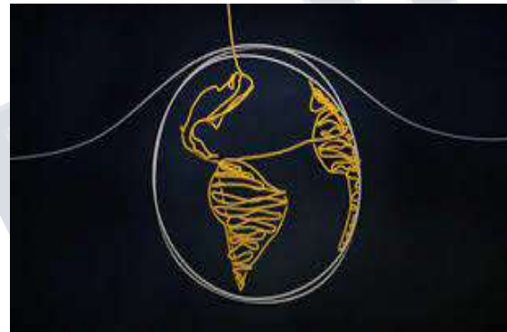
Fig 1: Introduction to The Loon

Project Loon is a research and development project being developed by Google with the mission of providing Internet access to rural and remote areas. The project uses high-altitude balloons placed in the stratosphere at an altitude of about 20 mi (32 km) to create an aerial wireless network with up to 3G-like speeds. Because of the project's seemingly outlandish mission goals, Google dubbed it "Project Loon". The balloons are manoeuvred by adjusting their altitude to float to a wind layer after identifying the wind layer with the desired speed and direction using wind data from the National Oceanic and Atmospheric Administration (NOAA). Users of the service connect to the balloon network using a special Internet antenna attached to their building. The signal travels through the balloon network from balloon to balloon, then to a ground based station connected to an Internet service provider (ISP), then onto the global Internet. The system aims to bring Internet access to remote and rural areas poorly served by existing provisions, and to improve communication during natural disasters to affected regions. Key people involved in the project include Rich Devalue, chief technical architect, who is also an expert on wearable technology; Mike Cassidy, a project leader; and Cyrus Behroozi, a networking and telecommunication lead.