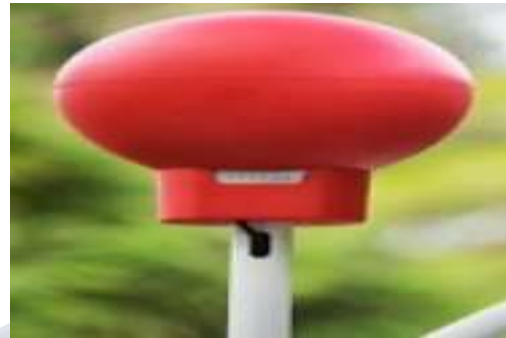
Fig 10 : Receiver that receives signal from the Balloon

Balloons will fly in the stratosphere well above commercial air traffic and weather events, at around 18-27 KM or 60,000 to 90,000 feet.