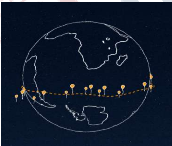
Fig 9 : Where Loon Is Going

The Project Loon pilot test began in June 2013 on the 40th parallel south. Thirty balloons, launched from New Zealand's South Island, beamed Internet to a small group of pilot testers. The experience of these pilot testers is now being used to refine the technology and shape the next phase of Project Loon. The pilot test has since expanded to include a greater number of people over a wider area. Looking ahead, project loon will continue to expand the pilot, with a goal of establishing a ring of uninterrupted connectivity at latitudes in the southern hemisphere, so that pilot testers in this latitude can receive continuous service via balloon-powered internet.