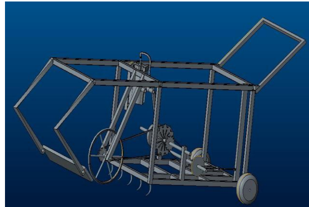
Fig 5.2.CAD model of our proposed Vehicle-2