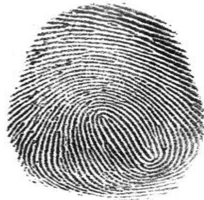
Figure 2: Loops