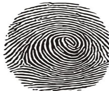
Figure 3: Whorls