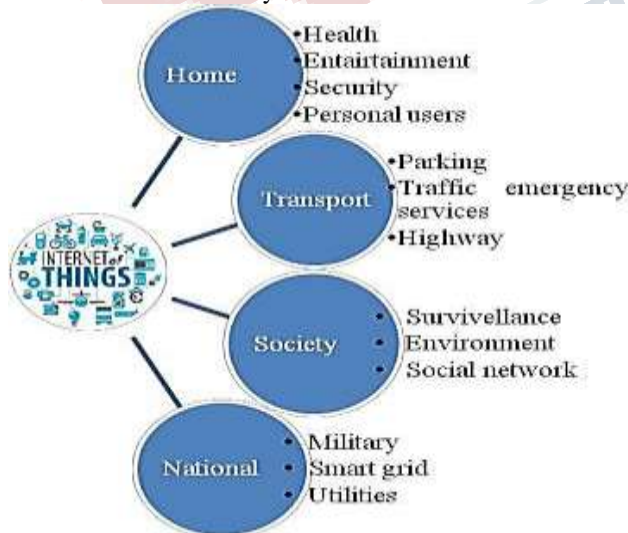
Fig-2 IoT based Smart City Applications

The Internet of Things (IoT) is the network of absolute items that is fixed with electronics, software, sensors and network connectivity that facilitates these objects to assemble and exchange data. The IoT allows objects to be sense and controlled, thus creating opportunity for direct interaction between the physical world and digital world across existing network infrastructure furthermore, results in improved efficiency and accuracy. The final aim is to achieve smart homes, parking, weather and water systems and traffic surveillance systems.