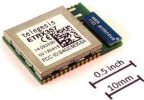
Fig-5 Zigbee module

6.1 Zig Bee: It is a low cost and low power communication technology. It helps in creating wireless personal area networks (WPAN) and other low power, low bandwidth. For applying of Zigbee, extra equipments like coordinator, router and zigbee end devices are require. This technology can be used in wireless switches and traffic management system.