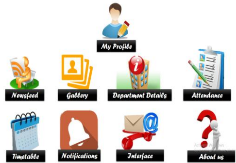
Fig 3. Modules in the application

• My Profile: In this module, the user can able to view his personal details, he can modify his name, password and other details.