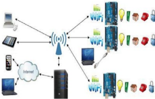
Figure 2: The Home Automation System Layout

Wi-Fi based home automation system [5] mainly consist three modules, the server, the hardware interface module and the software package. The same technology uses to login to the server web based application. The server is connected to the internet, so remote users can access server web based application through the internet using compatible web browser. Software of the latest home automation system is split to server application software and Microcontroller firmware. The server application software package for the proposed home automation system is a web based application built using asp.net.