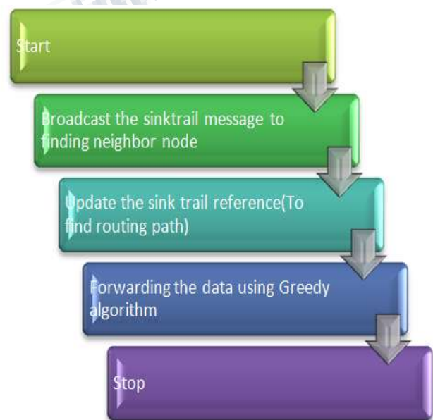
Fig.1. Data Flow in Mobile sinks

SinkTrail, a proactive data reporting protocol that is self-adaptive to various application scenarios, and its improved version, SinkTrail: A Proactive Data Reporting Protocol for Wireless Sensor Networks. SinkTrail-S, with further control message suppression. Main contributions of this paper are in SinkTrail, mobile sinks move continuously in the field in relatively low speed, and gather data on the fly. Control messages are broadcasted at certain points in much lower frequency than ordinarily required in existing data gathering protocols. These sojourn positions are viewed as —footprints of a mobile sink. Considering each footprint as a virtual landmark, a sensor node can conveniently identify its hop count distances to these landmarks. These hop count distances combined represent the sensor node's coordinate in the logical coordinate space constructed by the mobile sink.