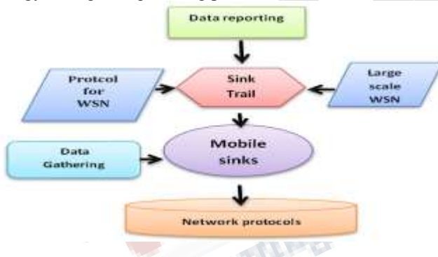
Fig.2. WSN architecture and SinkTrail with Mobile sink

The destination coordinate and its own coordinate; each sensor node greedily selects next hop with the shortest logical distance to the mobile sink. As a result, SinkTrail solves the problem of movement prediction for data gathering with mobile sinks. In this paper, the proactive data reporting protocol, SinkTrail, which achieves energy efficient data forwarding to multiple mobile sinks, and effectively reduces the number of sink location broadcasting messages. SinkTrail is unique in two aspects that is it allows sufficient flexibility in the movement of mobile sinks to dynamically adapt to unknown terrestrial changes; and without assistance of GPS or predefined landmarks, SinkTrail establishes a logical coordinate system for predicting and tracking mobile sinks locations, thereby significantly saves energy consumed during the data reporting process. The systematic analyze the impact of several design factors in SinkTrail and explore potential design improvements. The simulation results demonstrate that SinkTrail outperforms the Frequent Flooding Method (FFM) in finding shorter routing path and consumes less energy during data gathering process.