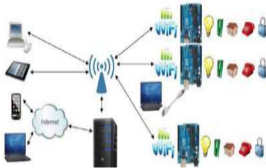
Figure 2: The Home Automation System Layout

Wi-Fi based home automation system [4] mainly consist three modules, the server, the hardware interface module and the software package. The same technology uses to login to the server web based application. The server is connected to the internet, so remote users can access server web based application through the internet using compatible web browser. Software of the latest home automation system is split to server application software and Microcontroller firmware. The server application software package for the proposed home automation system is a web based application built using asp.net.