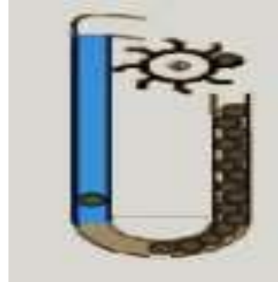
Figure 1: Perpetual Motion Machine Consisting of a Plumbing – Mechanic System

As an example: student of history Gaius Plinius Secundus (23 – 79 A.D.). In the e, here is a pipes – repairman system with imparting containers of various length as Fig.1, which contains two fluids with a significant contrast in thickness for example water and mercury. The globules that is destined to be moving never-endingly in the two cylinders, glide in the two fluids. Every globule that goes upwards due to the light power in the left cylinder falls onto the wheel, which turns in light of every globule's force, while subsequently drops into the right cylinder. There the expanded all out weight of the globules pushes the framed segment and along these lines another globule arrives at the base and afterward it ascends to the outside of the fluid in the left cylinder, etc. Regardless of whether this gadget isn't conceivable to work as a ceaseless motion machine, the genuine reason appears difficult to be found [4].