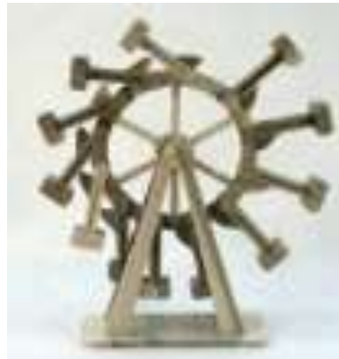
Figure 2: Device of Villiard De Honnecourt In 1253

energy is an ideal energy asset for tomorrow since it creates free energy with no sources of info. 'A down to earth manual with the expectation of complimentary energy sources', a course book wrote by Patrick J Kelly in the year 2002 contains different strategies for accomplishing free energy, two of them incredibly venerated; ShenHe Wang's Permanent Magnet Motor and Donald Lee Smith's attractive generator clearly clarifies the strategy to tackle attractive powers to change over it into electrical energy.