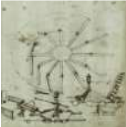
Figure 3: Devise By Taccola in 15thcentry