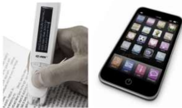
Figure 2: Hand-held Touch Screen Device

reference paper. A tale technique is acquainted with a structure limit model in CRF's has been proposed, which decided a versatile edge for recognizing signs. A far-reaching structure is exhibited that tends to two significant issues in a motion acknowledgment framework [2].