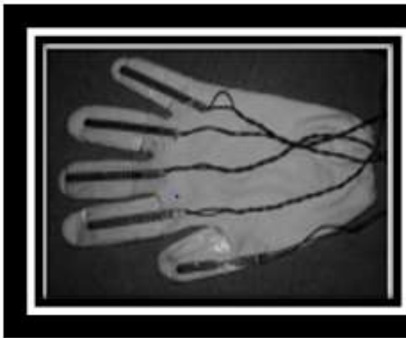
Figure 4: Gloves of Flex Sensor

Signed letters are resolved utilizing flex sensor on each finger. The flex sensors change their opposition dependent on the measure of curve in the sensor as appeared in figure 4.