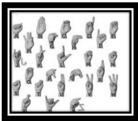
Figure 1: Sign Language Gesture

Gesture-based communication is the language utilized by quiet individuals and it is correspondence expertise that utilizes gesture rather than sound to pass on the significance of a speaker's considerations. Signs are utilized to convey words and sentences to the crowd. Motion in communication via gestures is a specific development of the hands with a particular shape made out of them. Gesture-based communication, for the most part, gives a sign to entire words. It can likewise give sign to letters to perform words that don't have a relating sign in that communication via gestures.