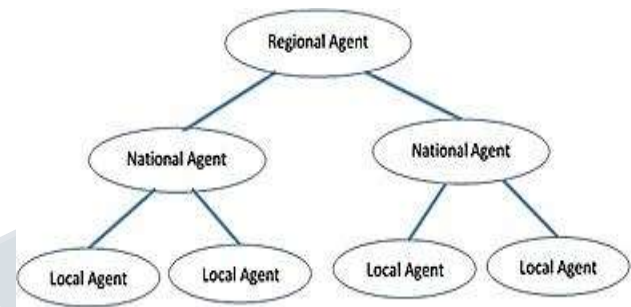
Figure 2: Agent Hierarchy

The relationship between all the three different levels of agents can be shown in figure2, using a top-down agent hierarchy.