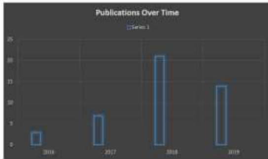
Fig. 1: Number of Primary Studies Published Over Time