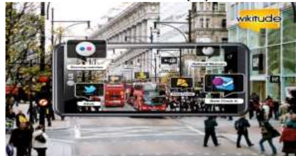
Fig III.3.1: Wikitude

Most i-phones have augmented reality applications developed. Applications like “Wikitude” which is used to find out details about a location without having to search for it. “Yelp” is another application where, a component called “Monocle” enables augmented experience. It is used to rate and review restaurants. [19]