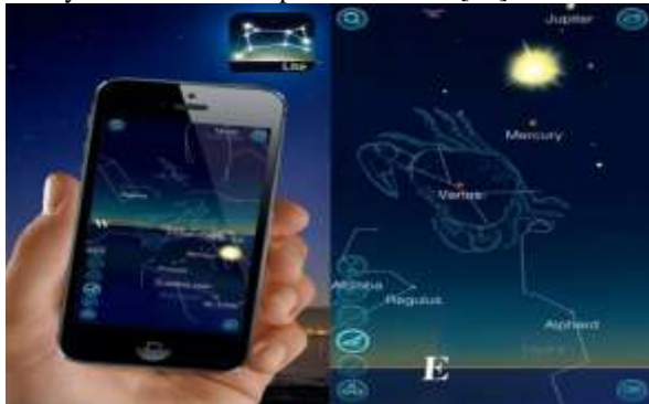
Fig III.3.2: Skyview

For all the cosmology enthusiasts there exist an application called “SkyView”. The user has to point the device upwards the sky and all the information related is directly available on the phone screens. [20].