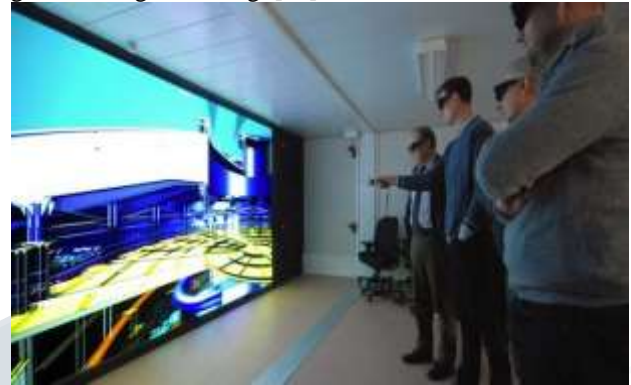
Fig II.5.1: VR headgear in construction and design

Virtual Reality offers various design patterns and options for construction of buildings. Blueprints of buildings and bridges can be developed using various tools. Simulation of constructions allow the builders to make amendments to the building based on the analysis. By doing this money and safety can be ensured. Also, various situations can be created to test the durability of the building while guaranteeing wellbeing. [10]