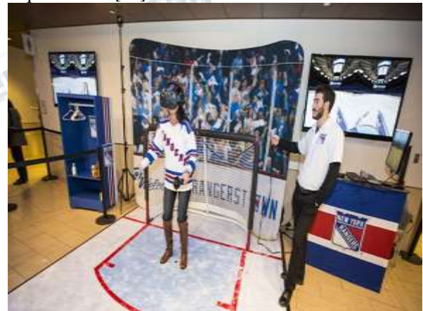
Fig II.6.1: VR in sports training

Using this performance of an athlete can be improved by providing necessary analysis and tips. It is also used to design equipment's where they can satisfy the high requirements. [11]