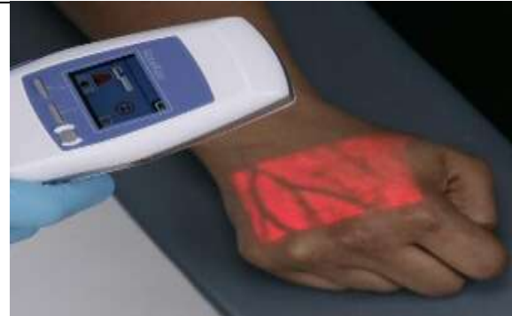
Fig III.1.2: AccuVein

Another application called AccuVein is used to spot the accurate vein location, as the chances of missing the vein is high. This done by projecting the device onto the patient’s wrist to check the locus of veins. [17]