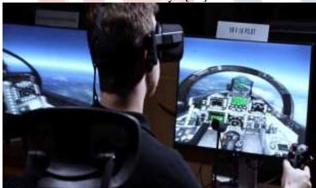
Fig III.4.1: Cockpit Simulation

In training an application called “Super Cockpit” is used to train pilots on flying and air travelling. The speciality of this application is that, the horizon was visible through the cockpit. Another training called “Forward Observer Training” uses augmented reality, wherein the fire team and the forwarder are given headgear and the instructor is given a screen to test the accuracy of the fire team. The environment is created virtually. [21]