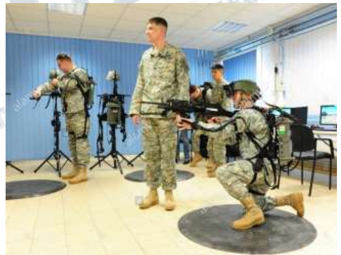
Fig: II.1.1 Military training using headgear

Virtual Reality, a combat environment can be created and soldiers can be trained under various assumed circumstances with none getting hurt. Some commonly used situations are flight training, boot camps, vehicle simulation. In flight training cockpit simulation is the most trained aspect as it needs high skill and accuracy in order to make better decisions while flying. [4]