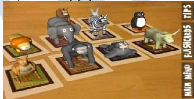
Fig III.2.1: AR Flashcard

The idea of showing the concept is widely accepted, hence there are numerous applications where augmented reality is used to enhance the learning. A Montessori application called “AR Flashcards” are used to teach toddlers and playschool kids. Another application called “Anatomy 4D” provides a better understanding of complex human body. [18]