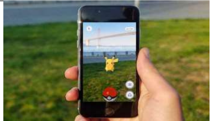
Fig III.5.1: PokemonGo

Earlier games were played on systems and arcades, but now they are in the mobile phones because of the augmented reality technology. The game called “Pokemon Go” is the best example wherein, smartphones are used to identify, capture and release these pokemons. This is the field where augmented reality most widely applied. [22]