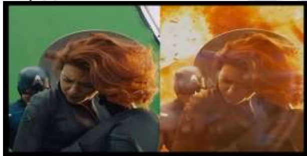
Fig II.3.1: VFX used in movies [23]

Gaming is the biggest and most successful testimony to applications of Computer Graphics. Various interactive platforms are built using this technique. The haptic systems and data gloves are instrumental in involving spectators to an extent [7]. Unlike earlier, the method of reaching out to crowd is different. Audio books, abstract art involving 3D shapes are all allowed using virtual reality. [8]