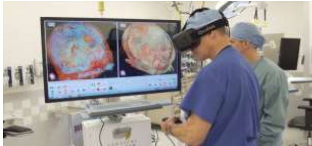
Fig II.2.1: VR headgear in medicine