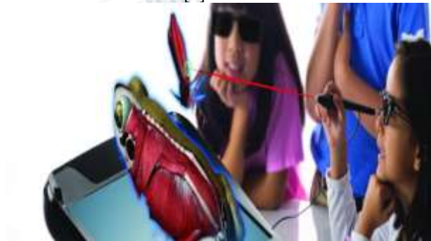
Fig II.4.1: Headgear used in education [24]

Images are used while teaching, that makes learning a fun experience. Virtual Reality gave a new dimension to teaching and learning process. Several courses are taught and learnt using the applications, that helps the content to reach a wider audience. [9]