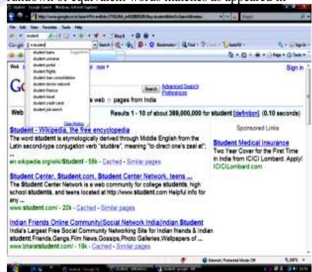
Figure 1: Google results for keyword 'Student'

Google is the most prevalent search engine which files the greatest number of publically index documents from the web among all other accessible search engines. It keeps up the word vocabulary and returns equivalent word words match in order arrange because of a given query keyword [10]. For example, because of the query keyword Student, the Google search engine restores a rundown of equivalent words matches as appeared in