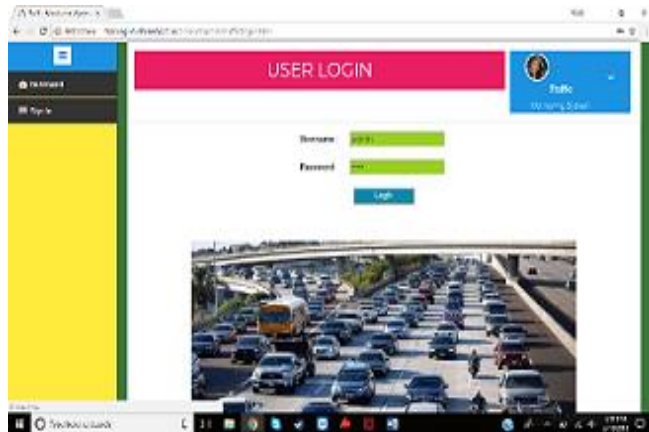
Figure 2 login page

The block diagram of Intelligent network traffic control system is shown in Fig. 1. Android application act as interface between smart phone and Bluetooth. Users give the input via the smart phone by using touch voice command. The android application and Arduino Bluetooth controller are the main applications for implementing the system. The voltage regulator, diodes and capacitors are being used for various control purposes Fig 1 gives the overview of the system architecture.