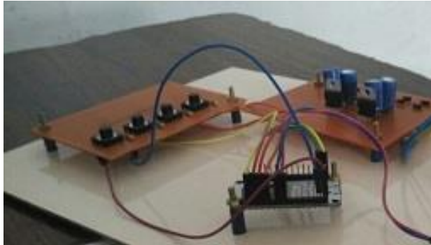
Figure Connection diagram

Step 4:- : From the serial buffer we get the stored id and passwords. Here is the code for the WIFI connection