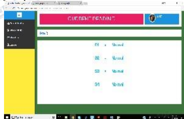
Fig: Current status at traffic signals

Step2:-If we are travelling we can choose the best path for travelling with low traffic and we can start our journey.