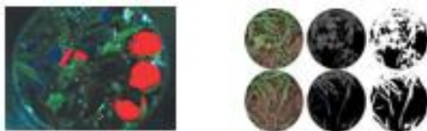
Fig Processed image under MATLAB

The programmed location and orientation of the robotic arm is stored with each image. For each sector, all ripe fruits are identified by the image processing software, listed, and picked one by one in a looped task. To improve the therapeutic effect of the image processing in finding and locating the apples on the tree, the platform was designed to control the lighting conditions to the greatest extent possible, using a canopy to cover the entire tree. The MATLAB platform is also used to reduce the effects of changing ambient lighting conditions and provide a uniform background (blue) to ease location.