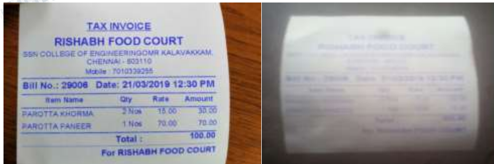
(a) (b) Fig.5 a) High clarity camera b) Low clarity camera