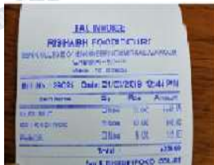
Fig.3 a) Restaurant bill b) Result