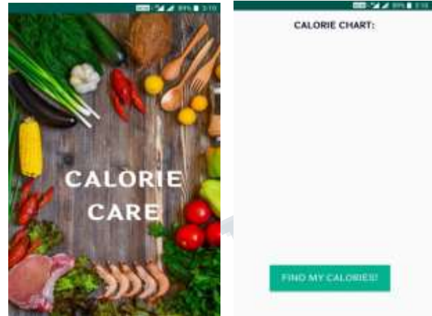
Fig.2 Application UI

Figure 5 and 6 shows the bills of different quality of the camera.