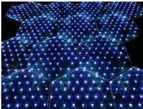
Figure - A Solar Highway

The solar roadways will have LEDs and will illuminate the lanes. LEDs can be programmed to show the traffic instructions as well as national messages.