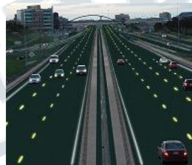
Figure - A Solar Smart Highway

Solar roadways are also smart roads with electronic LED displays built-in. Warning signs with LED text to warn people about downed limbs, animals, and construction can be displayed directly on the road ahead. And they can also help with power lines and poles. A cable corridor runs underneath, housing power lines, cable lines, and fiber optics, replacing the need for telephone poles. It also serves as a transportation system for storm water, running it to treatment facilities.