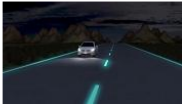
Figure – Intelligent Solar Roads

It pays for itself through the generation of renewable energy viz., TV, telephone, high-speed internet, intercommunication between roadway and cars to avoid collision. It is an Embedded Tracking system.