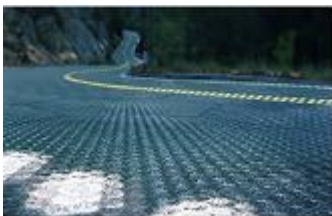
Figure - Solar Roads for clean air

Emission of greenhouse gases will be greatly reduced. So no more global warming in the solar roads.