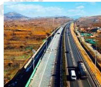
Figure - Solar Roads with organic food cultivation

Organic food cultivation and medicinal plants beside the solar roads will help in providing the communities to get good food and building immunity.