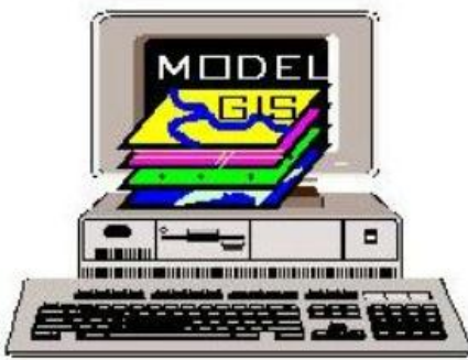
Figure – Integration