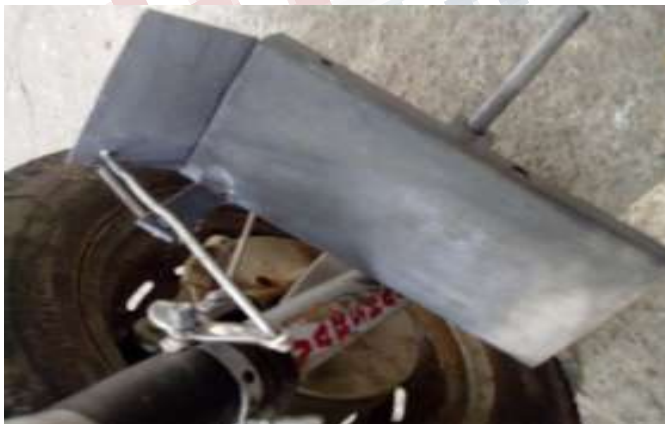
Fig 3.1 Brake pedal

Front brake - Drum brake (Mechanical type) Back brake - Disc brake (Hydraulic brake). The front brake was fixed right side pedal in front axle