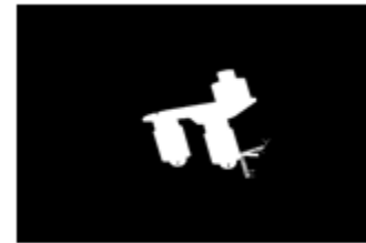
CAD model of steer column Fig 3.2