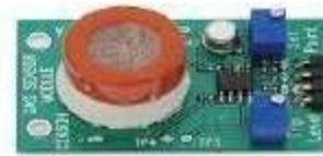
Fig 1.2 Alcohol gas sensor-MQ-3

This alcohol sensor is suitable for detecting alcohol concentration on your breath, just like your common Breathalyzer. It has a high sensitivity and fast response time. Sensor provides an analog resistive output based on alcohol concentration.