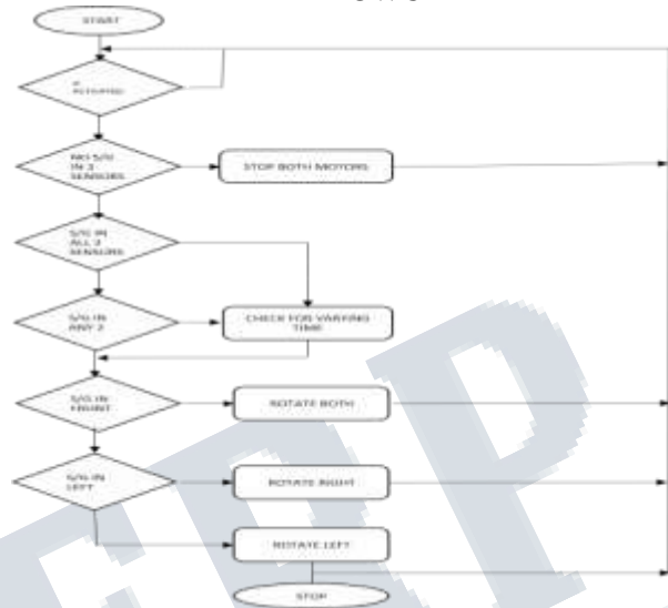
Fig 2.7 ALGORITHM