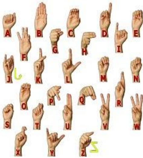
Fig. 1: Gesture for Alphabets

minimized. We have proposed a system which is able to recognize the various alphabets of Indian Sign Language for normal and mute interaction giving more accurate results at least possible time. It will not only benefit the mute people of India but also could be used in various applications in the technology field. Fig 1 describes the gestures made in Indian Sign Language to represent the English alphabets.