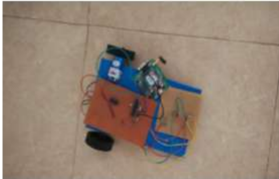
Fig.3. System design