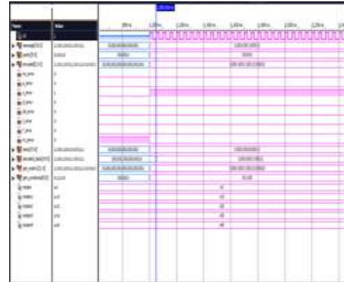
Simulation result for single bit error Double and Parity Error

Hardware kit consists of Zigbee transmitter, Zigbee receiver, Spartan 3E, encoder section and decoder section. The encoder section and decoder section are used to display the errors and the location of errors in the decoding section. In two way communication, hamming code with single bit error correcting and detecting is useful i.e land line communication but the hamming code technique with detection of more but with low cost is more advanced to determine errors with error free concept and location of errors occurred on the SRAM based FPGA configuration frame.