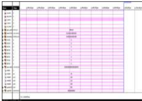
Simulation result for triple bit error