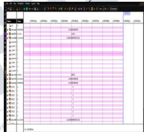
Simulation result for double and parity bit error Double Bit Error