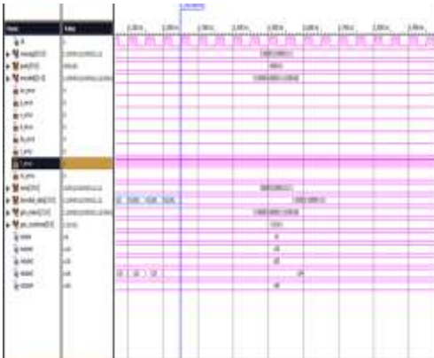
Simulation result for four bit error