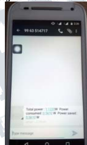
Fig 6: Message received to the prescribed number.

In the figure5 & 6 represents that, message can be sent to the control room then how much power consume and power save it receives in the form of SMS way to the prescribed number.