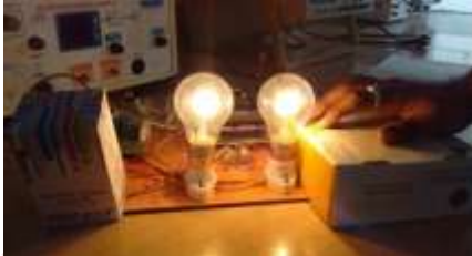
Fig3: Both the street lights are in dim mode.

Condition 1: Both the street lights are in dimming mode.