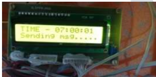
Fig 9: Message sent to the control room

In the above figure 8 represents that ‘C’ indicates that Consume and ‘S’ indicates that Save.