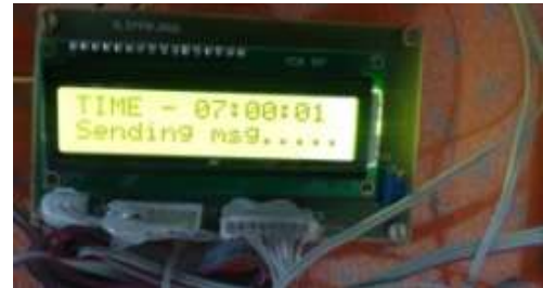
Fig5: Message sent to the control room.

In the above figure 4 represents that ‘C’ indicates that Consume and ‘S’ indicates that Save.