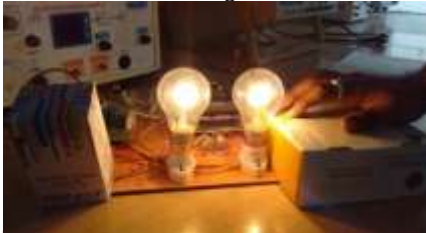
Fig3: Both the street lights are in dim mode.

Condition 1: Both the street lights are in dimming mode.