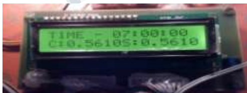
Fig4: Power consumes & power saves displayed in LCD unit.

In the above figure 4 represents that ‘C’ indicates that Consume and ‘S’ indicates that Save.