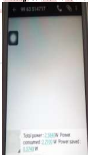
Fig10: Message received to the prescribed number.

In the above figure10 represents that, how much power consumes and power save received to the prescribed number.