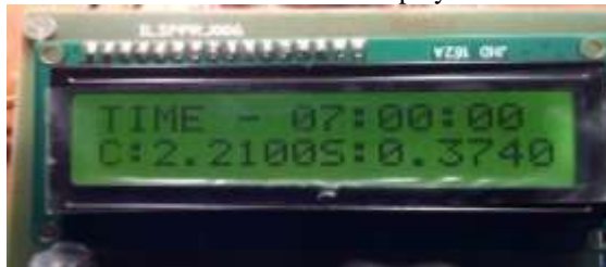
Fig8: Power consumes & power saves displayed in LCD unit.

In the above figure 8 represents that ‘C’ indicates that Consume and ‘S’ indicates that Save.