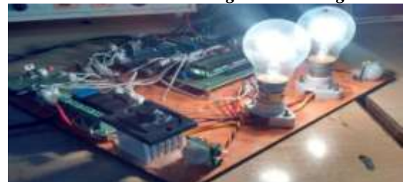
Fig7: Both the street lights are in bright mode.

Condition 2: Both the street lights are in bright mode.