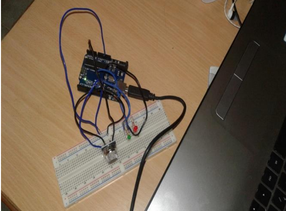
Fig.3 Hardware Interfacing with arduino

pressure given by the pump in the end of the system. At the same time the temperature sensor (LM35) which detects the temperature of the compartment. When the smoke sensors value exists the preset value and the temperature sensor detects the temperature above 80 °C arduino enables the buzzer, gives information to the nearby station using Zigbee. Fire extinguisher also gets enabled for minimizing the spread of fire.