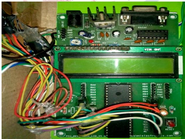
Figure.3: Microcontroller system

The application software was developed in c language using KEIL software of version 8.08.The basic operation of the system is shown as flow chart in fig.2.