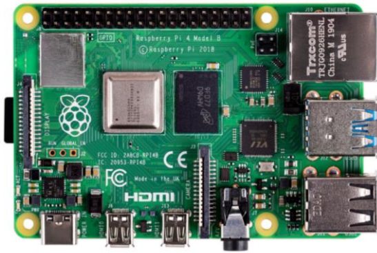
Fig-2: Circuit of Raspberry Pi-4 Model B

Input power: 5V DC via USB-C connector (minimum 3A1 ) 5V DC via GPIO header (minimum 3A1 ) Power over Ethernet (PoE)–enabled (requires separate PoE HAT). Environment: Operating temperature 0–50°C.