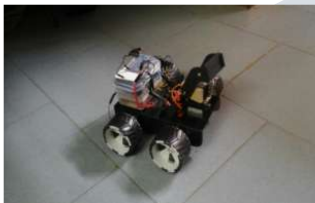
Fig. 3. The Endurance under experimentation after partial hardware assembly

A variety of experiments have been conducted to test the ability and reliability of the machine under various circumstances. The machine could deliver a wireless communication distance of about 300 m LOS communication without any noise interference. However due to interference, the camera could provide satisfactory functions only up to a certain range but this can definitely be improved by adjusting the band width and the power of the transmitter receiver pair. The infrared vision was quite satisfactory. The temperature sensor was subjected to various temperatures and the outputs were verified with the help of digital thermometers. The turning radius required was even lesser due to differential control and the torque of the motors provided a climb of 55 degrees at the controlled environment used.