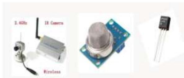
Fig. 2. IR Camera, IR Range Sensor, LM35 Sensor

Air Quality sensor MQ135 that is capable of providing the ppm value of the gas, whose concentration is being measured. It is highly sensitive to a variety of toxic gases like nitrous oxide, sulphur dioxide, methane, ammonia, CO 2 etc.