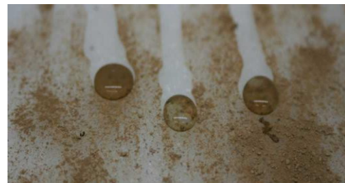
Figure 2: Picture depicting rolling down of water droplets carrying dust particles on a super hydrophobic surface.

in a month investigation [2]. Dust and rain water droplets get accumulated over the glass surface of solar panels and it causes corrosion in solar panels. Due to soiling effects, the optical parameters are affected which reduces the energy generation due to low light transfer hence causing additional loss in the overall efficiency [3]. Therefore regular cleaning of the solar panels becomes indispensable which causes scratches on the glass panels. Super hydrophobic coating will act as anti-dust coating and reduce accumulation of dust particle on it. It also helps to repels water, viscous liquids, and most solid particles. Superhydrophobic coatings make surface highly water repellent and water droplets form contact angle of more than 1500 with the surface. When water droplets fall on the coated surface it rolls down carrying dust particles and hence the panel surface remains clean for long time[4].