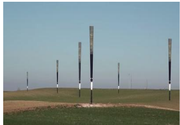
FIG-5 Vortex wind farm [14]

Instead of capturing energy as a result of the circular motion of a propeller, the bladeless wind turbine "takes advantage of what's known as vortices, an aerodynamic effect that produces a pattern of spinning vortices". The spinning winds it creates can lead to oscillating motions, or vibrations in structures. However, instead of trying to avoid this energy, the Vortex Bladeless is attempting to capitalize on it. The mast, which is made from a composite of fiberglass and carbon fiber and zero moving parts, is designed to ensure that spinning winds, or vorticities, occur synchronously along the totality of the rod as naturally occurring wind passes by. The spinning winds that result cause the pole to oscillate, or vibrate, as much as possible. The wind turbine is then able to harness the kinetic energy created by the oscillations and convert it into electricity. Vortex Bladeless are clearly taking a completely different standpoint into generating wind energy. It's "oscillating rod" harnesses almost the same amount of wind energy as a modern windmill would. The modern windmill can convert around 80%-90% of kinetic wind energy into whereas the bladeless wind turbine at this stage can only convert around 70% of wind energy into electricity. [10]