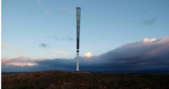
FIG-6 Vortex Windmill [13]