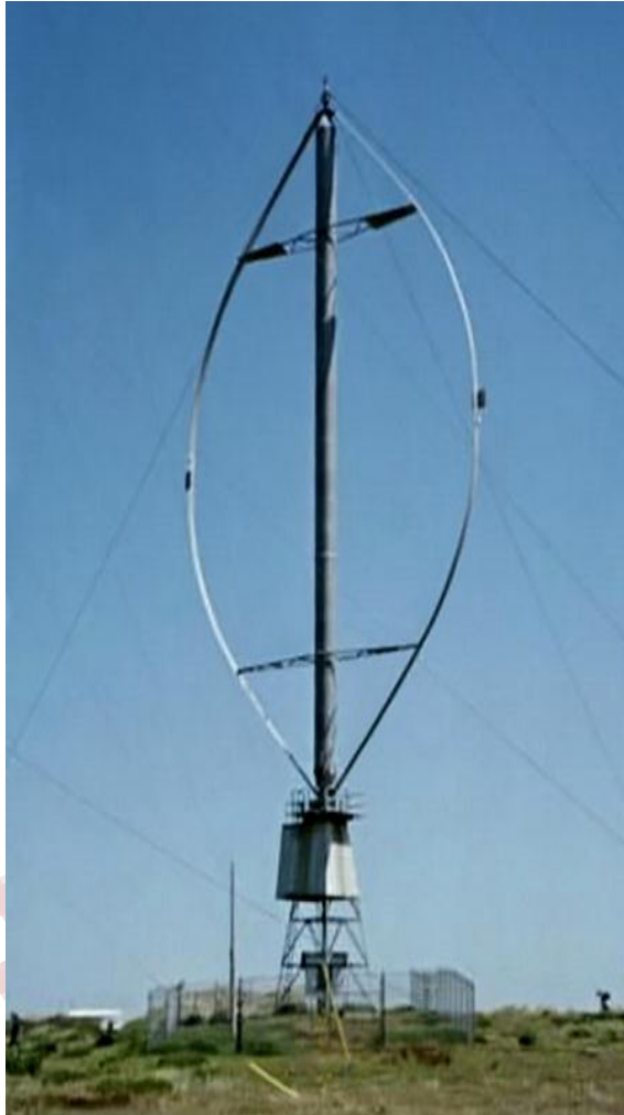
FIG-2 Vertical axis windmill [3]

consistent, or due to public ordinances the turbine cannot be placed high enough to benefit from steady wind.[2]