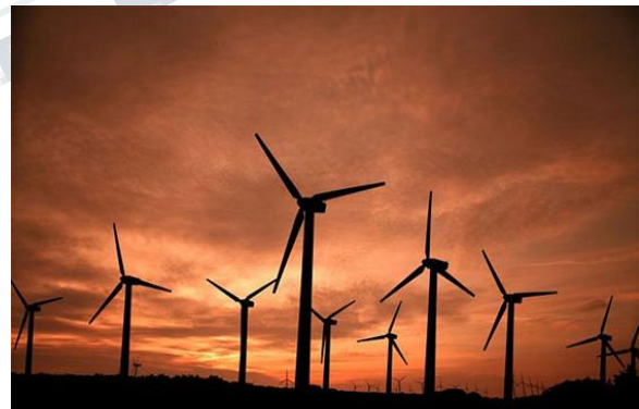
FIG-1 Horizontal axis windmill [11]

Horizontal axis means the rotating axis of the wind turbine is horizontal, or parallel with the ground. In big wind application, horizontal axis wind turbines are almost be there. The horizontal-axis turbine typically has a three-blade vertical propeller that catches the wind face-on. The advantage of horizontal wind is that it is able to produce more electricity from a lesser amount of wind. The disadvantage of horizontal axis still is that it is generally heavier and it does not produce well in unstable winds.