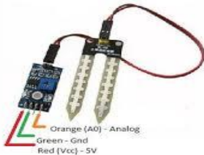
Fig. 2: Soil Moisture Sensor probe.

For sensing the level of moisture content available in the irrigation field a moisture sensor is used. Moisture sensor has a level identification module in which we can place a referral value. Soil moisture sensor probe shown in Fig. 2. By using the soil moisture sensor the soil moisture content and moisture level can be found.