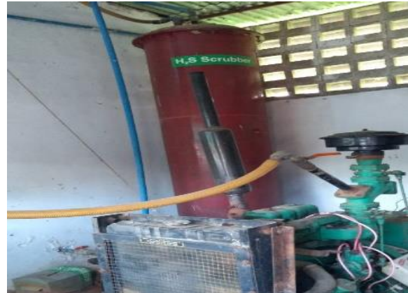
Fig.3 H2S Scrubber

sewage, municipal waste, green waste, plant material, and crops. Biogas comprises primarily methane ( \text{CH}_4 ), carbon dioxide ( \text{CO}_2 ) and small amounts of hydrogen sulfide ( \text{H}_2\text{S} ), moisture and siloxane.