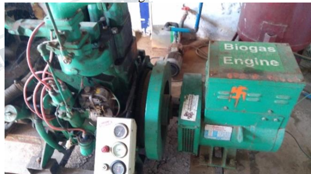
Fig.4 Biogas Generation

These Engines operate with gases obtained from bio methane plants or biogas (Gober) Plants. Biogas plant generates methane gas by anaerobic digestion of organic matter, traditionally animal manures and industrial, agricultural wastes are used for biogas generation. The gas obtained from methane gas plant is an environment friendly, cheaper and is a continuous source. The raw gas has to be cleaned from toxic gases and moisture. The appropriate equipment should be removed to the harmful gases.