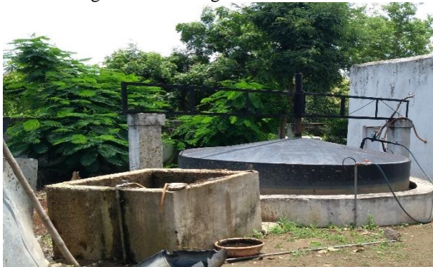
Fig.2 Steam Digester Tank

This type of biogas digester is very common. In this design, the container collecting the slurry and the container collecting the gas are combined. The gas collects on top of the slurry. As the gas accumulates, the slurry is forced into another container. After the gas is removed the slurry will flow back into the container it was in initially. In addition to plant matter and vegetation, other types of organic matter that can be broken down is human sewage and cow dung.