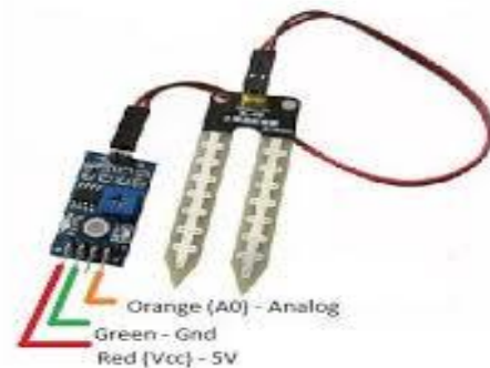
Fig. 2: Soil Moisture Sensor probe.

A moisture sensor is used to sense the level of moisture content present in the irrigation field. It has a level detection module in which we can set a reference value. This circuit can be used with analog probes that produce a voltage proportional to soil moisture such as VG400 probe shown in Fig. 3. The moisture content of the soil is found by using the soil moisture sensor such as VG400 which produces an equivalent output voltage proportional to the conductivity between the two probes.