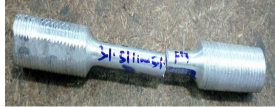
Fig 4: tensile test specimen of Al 6061 with 3% sic and 5% fly ash