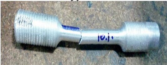
Fig 5: tensile test specimen of Al 6061 with 6% sic and 10% fly ash