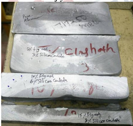
Fig 7: Hardness test specimens of Al 6061 with fly ash and sic all compositions