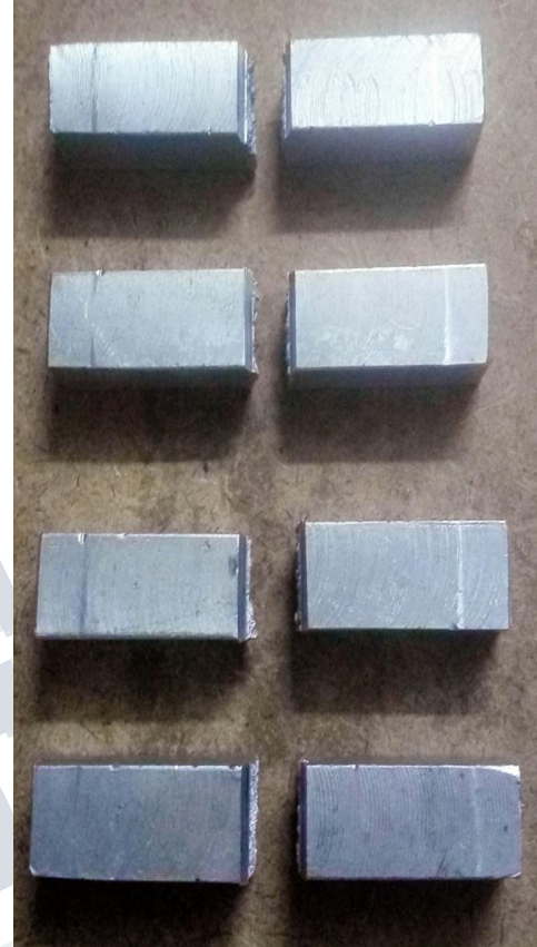
Fig 7: impact test specimens of Al 6061 with fly ash and sic all compositions

The results of tensile, yield strength, Hardness test and Impact test are as tabulated in table 2