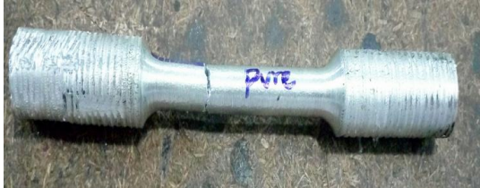
Fig 3: Tensile test specimen of pure aluminium 6061