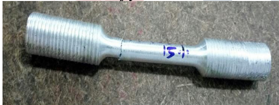
Fig 6: tensile test specimen of Al 6061 with 8% sic and 15% fly ash