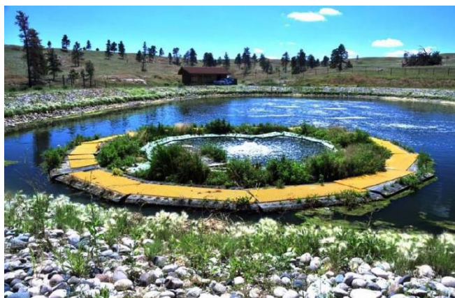
Figure 4 – Aerated lagoon with AFIs at Rehberg Ranch, USA (Floating Island International Inc. USA (2011))

Zhaohua et al. (2013) analysed the social-economic benefits of AFIS, and they gave suggestions to China for applying AFIs technology to improve the water environment and to cultivate crops thereby creating a “win-win” model for both environmental protection and agricultural development in rural places. The AFIs are classified as shown in Table 4. Wet type AFIs are deployed for water purification as plant roots come in direct contact with waste