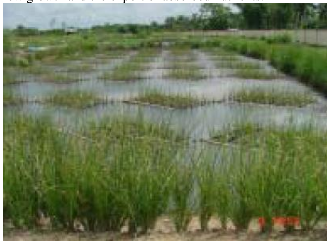
Figure 1- Vetiver pontoons Vietnam

Ash and Truong(2004) have presented a case study wherein in situ preliminary treatment of the pond effluent was accomplished by floating platforms placed in the ponds (Figure 1). The 21 floating pontoons were designed so Vetiver plants sitting on the pontoons and the roots suspending in the effluent. The size of each pontoon is 2.4m x 2.4m with about 300 individual plants placed on each pontoon. The number of pontoons required was based on the level of nutrient load. Maintenance program included replacement of dead plants, regular harvest to encourage new growth and the export of absorbed nutrients.