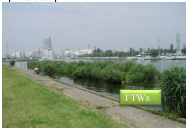
Figure 3 - AFI in Lake Kasumigaura

Nakamura and Mueller (2008) have put forth significance of FTWs as a Restoration Tool for Aquatic Environments. They specified four functions of artificial floating islands (AFIs) as: 1) water purification, 2) habitat enhancement, 3) shore line erosion protection, and 4) improved landscape features.