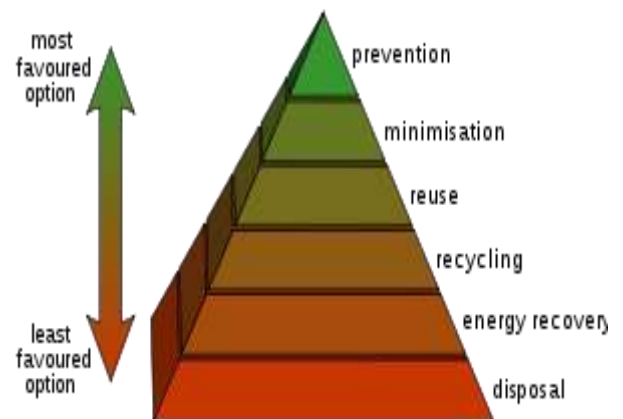
Fig.2. Pyramid of plastic waste

8) Polyethylene terephthalate (PET) and high density polyethylene (HDPE) bottles have proven to have high recyclability and are taken by most curbside and drop-off recycling programs. The growth of bottle recycling has been facilitated by the development of processing technologies that increase product purities and reduce operational costs. Recycled PET and HDPE have many uses and well-established markets. In contrast, recycling of polyvinyl chloride (PVC) bottles and other materials is limited. A major problem in the recycling of PVC is the high chlorine content in raw PVC (around 56 percent of the polymer's weight) and the high levels of hazardous additives added to the polymer to achieve the desired material quality. As a result, PVC requires separation from other plastics before mechanical recycling [9]