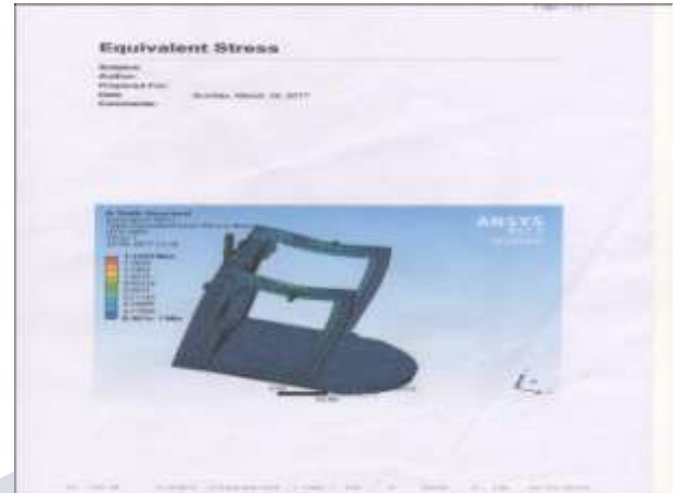
Fig-3 Equivalent stress of base frame.

The above figure shows the analysis of base support in loaded condition. Maximum Von Misesstress is 1.5343Mpa.