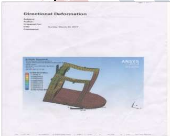
Fig-2 Directional deformation of base frame.

The above figure shows the analysis of base support in loaded condition. Maximum displacement is 0.0001054mm.