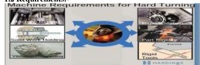
Fig no.1. Machine Requirements