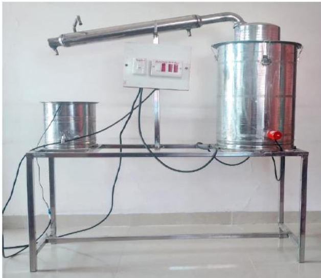
Figure No: 2, Actual Model of Extraction Unit

structure capacity of 50 lit approx which have heating coils inside to heat , which is then connected with steel pipe which goes through one end of condenser which is used for cooling the formed steam and then from other end of condenser the water droplet receiving pipe is connected from which cooled water droplet is goes and collected in collecting drum. The thermostat is also used for measurement of rising temperature of boiling unit And cooling water unit is separated connected at bottom side which supplies continuously cooled water to condenser for cooling the steam. This unit is connected to condenser from two point, one is input and other is output. From input point the cooled water is supplied to condenser to cool down the steam and from output point the heated water is collect out in cooling Drum, then this heated water is again get cooled in cooling drum and it again supply to condenser, this process is happen continuously. The separating funnel is used for the separation of essential oil and extract water.