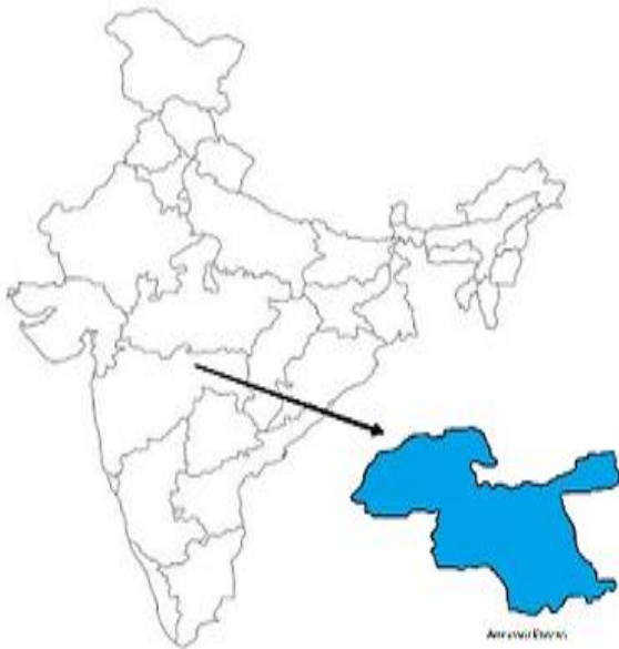
Fig 2: Amravati District

sukali are about 10 meters high. The quantity of waste dumped in this dumpsite was derived is about 4.51 Lakh M 3 under earmark area of 6.55 Ha. The Amravati Municipal Corporation proposed the work required for scientific dumpsite land reclamation through bio-remediation and biomining of dumped legacy waste.