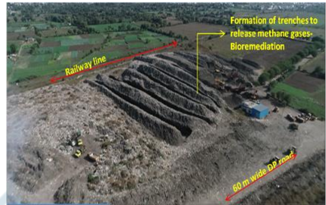
Fig 3 : Formation of windrows

Sukali compost depot site as dumpsite is being in operation since last more than 30 years. Amravati open dumps at a