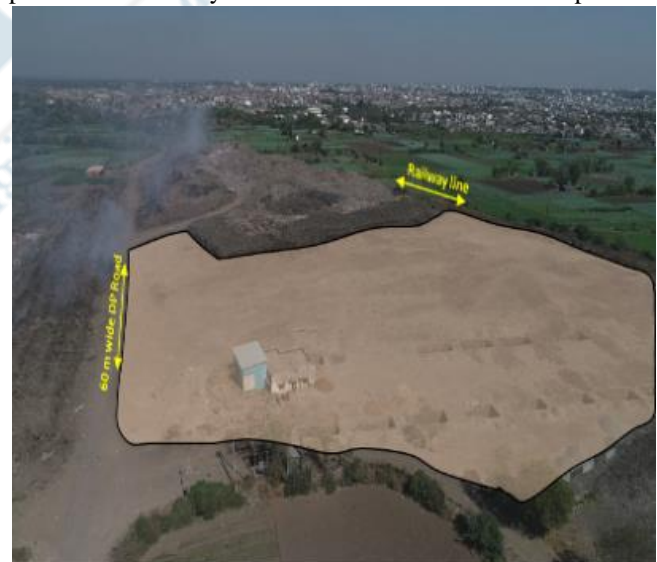
Fig 6: 3.28Ha of reclaimed land at sukali dumpsite

Legacy waste situated in the dumpsites is a huge threat to our physical body conditions, really has disturbing effects on environment, disturbs cycles of wildlife and should invest in greater sustainability towards our planet. Bioremediation a microbial decomposition procedure can help to reduce and remove the said pollution and attempt to provide clean drinkable water, air and healthy soil for plantation and vegetation and can invest in future generations. Biomining requires lesser resources and minimum energy than conventional technology that uses conventional energy resources and does not gather a dangerous by-product as waste in the environments. Management of legacy waste has created an ecosystem of technology waste solutions for deriving land as a resource from legacy waste dumpsite. But it came with its unique operational and technical challenges. The above study explored the importance of management of legacy waste for sustainable development. Out of the 9.35 Ha of dumpsite land, 3.28 Ha of land had been reclaimed by AMC through the process of biomining results in reduction of environmental and soil pollution by 35%. The reclaimed land can be used for future projects. Because of biomining process the large quantity of legacy waste is eliminated and this process will be very beneficial for sustainable development.