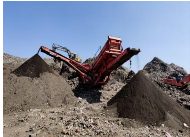
Fig 4: Screening of Legacy Waste

through recycling, co-processing. The stabilized waste recovered from the dumpsite are screened into different size particles that can be reused outside of site or disposed off without having any adverse effect on environment. Screen sizes commonly used are 150 mm, 80 to 100 mm, 30 to 50mm, 30- 10 mm, and 4-6 mm. The 150 mm screening of waste contains bricks coconut, shells, cloths, footwear, large plastics, etc. The 80 to less than 30 mm screening of waste shredding as per requirement or industry need. The lighter materials mostly such as plastics are shredded as per requirement of industry for use in bitumen hot mix plants usually to make recyclable Plastic Roads or as refuse derived fuel (RDF) which is use in cement kilns. The 4-6 mm screening of waste contains the finest materials and is called bio-earth or good earth.