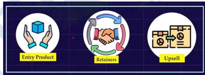
Fig.3 The Three Product Business Model

Impressively, Paytm deployed 30,00,000 Soundbox devices by August 2022, overshadowing PhonePe's 1,00,000 devices. This highlights Paytm's agility in identifying and addressing merchant pain points, emphasizing its commitment to delivering a seamless and convenient experience.