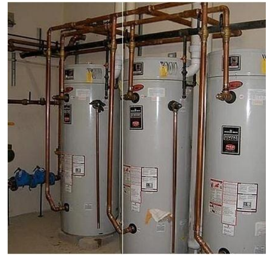
Fig: Chlorination Tanks used for disinfecting water

Shoot length, fresh weight and dry weight, but the growth rate decreased with increasing concentrations of chlorine. Root length was significantly improved with increasing chloride dose column are significantly different with respective control at p<0.05(LSD).