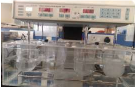
Fig 3. Calcium Dissolution apparatus

calcium carbonate content is nearly 85 % .This can be used very effectively in various applications.