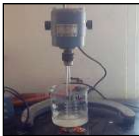
Fig 2. Set up for calcium extraction

effectively used in food processing industry. Rambutan flesh when blanched in solutions containing 1% NaHSO 3 added with 0; 2.5 and 5 percent calcium chloride . The results showed that the use of calcium chloride in the blanching solutions tend to decrease the pH and vitamin C content of the fruit flesh. On the other hand, the total acids, syrup strength (sugar concentration), and organoleptic scores for texture and color increased. During the two months storage the pH increased while the vitamin C content decreased. [22] This process of extracting calcium chloride provides a way out to use the discarded eggshells and using its extract in some useful application such as food processing aid.