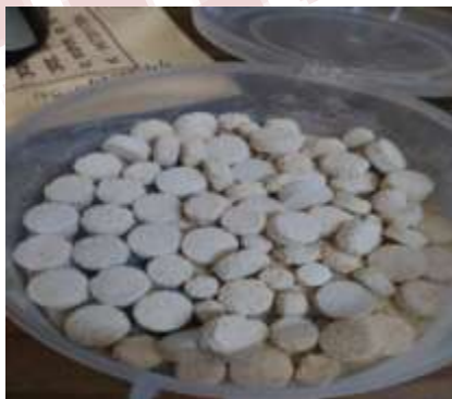
Fig 4. Chicken egg shell tablets