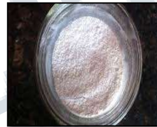
Fig 1.Eggshell powder

After collection the next step was to clean them with tap water and boil them. 12 egg shells were taken in 6 cups of filtered water. The cleaned eggshells were cooked in it for 10 minutes The shells were drained out. Then they were spread out on glass or stainless steel baking sheet and dried overnight .In the morning, they were dried in oven at 200^\circ\text{C} for about 10 minutes. After this, they were pulverized into a granular form by grinding in a mixer.