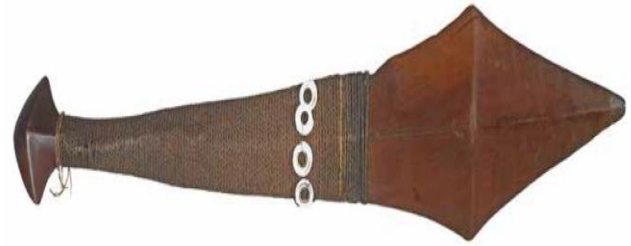
46 This Malaitan sub-i-club was obtained by Alexander Duffield while visiting the Solomons on a Queensland labour-recruiting ship in the early 1880s. Like most Malaitan artefacts obtained by Whitemen in those times, its precise origin and identity were forgotten. (British Museum, Oc+2343, length 79cm) 13

The possessive and covetous mind of Europeans is evident by the Subi-a sort of club- displayed in British Museum. This fine piece of work was possessed but its exact origin or identity is unknown. (Burt, 2012). It will not be judgmental per se to state that had Basset managed to bring the exotic sphere to the civilization, it too would have suffered fate of this Subi. It sad destiny would have been remaining as an obscure exhibit in some museum with forgotten origin and identity.